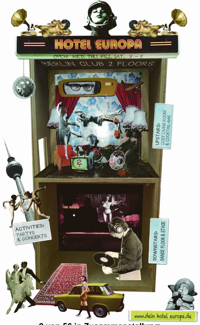
2 von 56 in Zusammenstellung DISTRABE 54